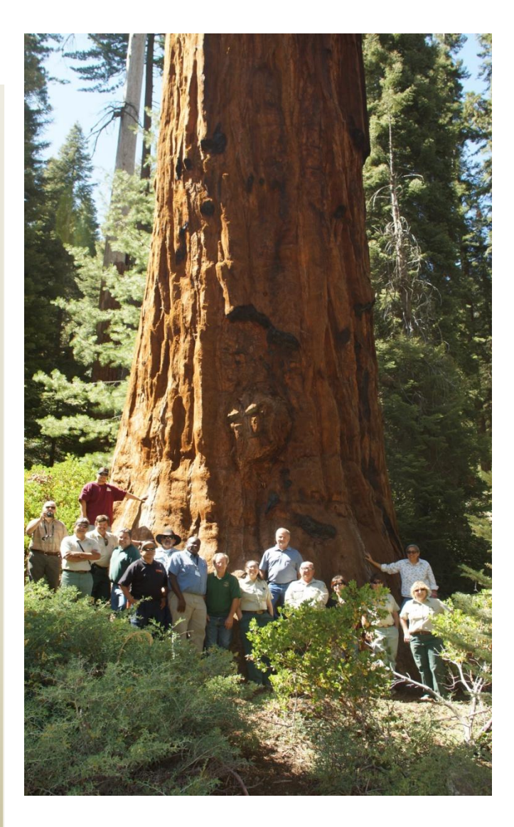
Sequoia NF – Tule River Reservation Site Visit July, 2012