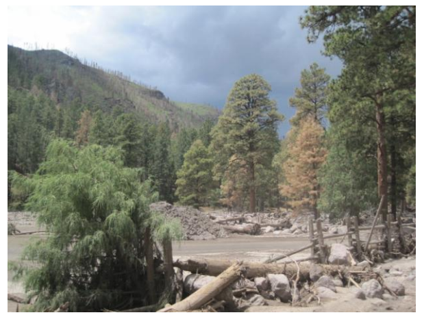
The TFPA can address hazardous conditions for wildfire which could damage lands and resources of concern to Indian Tribes. A series of three wildfires that originated on Forest Service lands affected the headwaters of Santa Clara Creek and contributed to severe monsoonal flooding, extreme erosion of the stream channel and sedimentation of water retention and fishing ponds of the Santa Clara Pueblo Tribe. July 2012.

Volume II contains several appendices that support and supplement Volume I: (A) the TFPA; (B) results of online surveys; (C) success stories; (D) site visit reports; (E) proposed training modules; (F) reference materials pertinent to TFPA implementation; and the (G) methodology used to conduct the investigation.